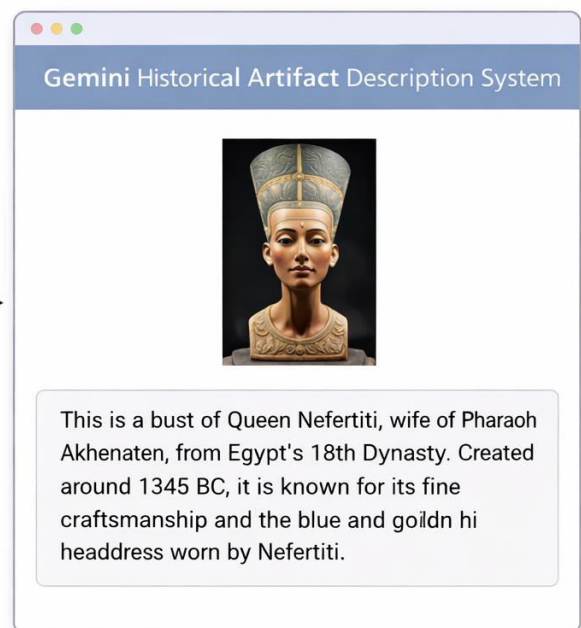
Fig. 4. Generated Output Description